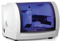
BD MAX™ System

Visit BDMAXDIFFERENCE.COM to find out how